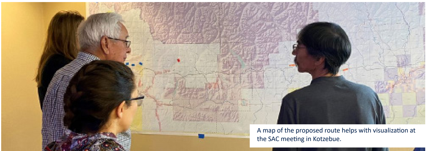
A map of the proposed route helps with visualization at the SAC meeting in Kotzebue.

Interim Program Manager, Ambler Access Project